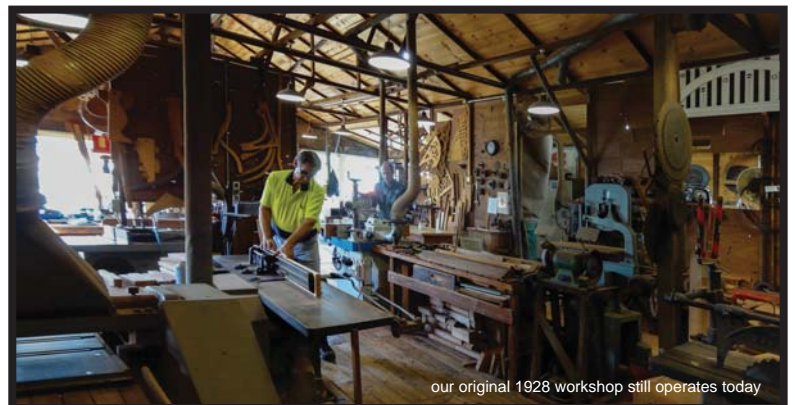
our original 1928 workshop still operates today

Woodworkers has always been the leader in innovative design of timber joinery and boasts the visually strongest standard moulds and details in the industry. At Woodworkers it's the details that make all the difference and set us apart.